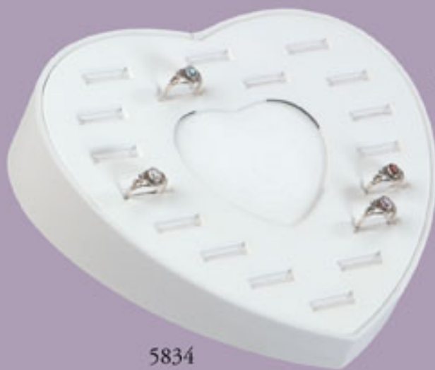
5834 18 Slots, Logo