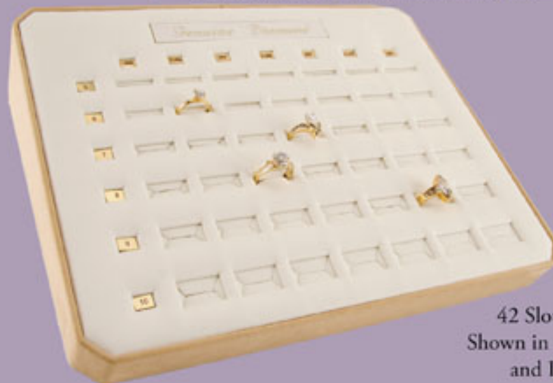
5681 42 Slots, 13 Infoblocks, Logo Shown in Palomino Charisma frame and Pearle Vienna top pad