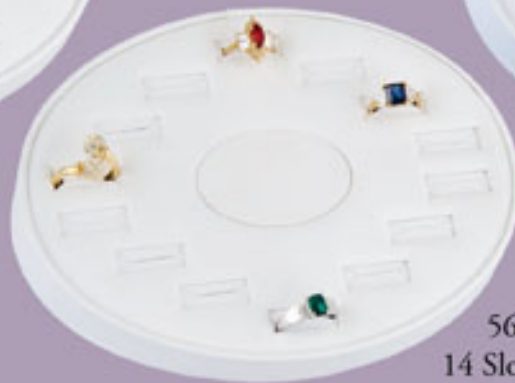
5632H 14 Slots, Logo