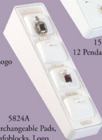
5824A 4 Interchangeable Pads, 4 Infoblocks, Logo