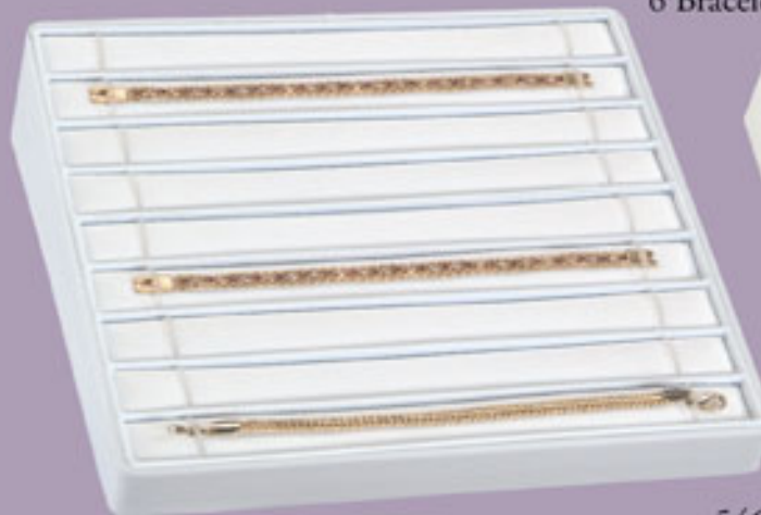
5468A 9 Bracelets