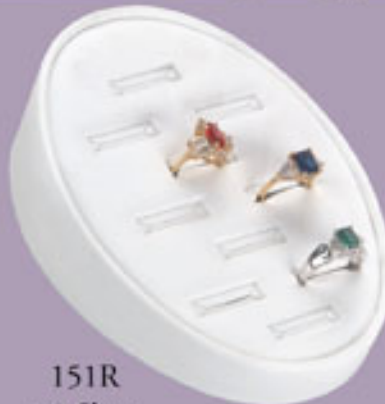
151R 10 Slots