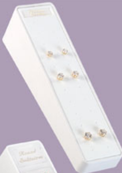
155C 12 Stud Pairs, Logo