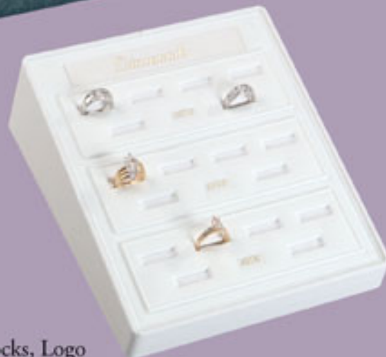
5461 21 Slots, 3 Infoblocks, Logo

All text on infoblocks and logos can be made in dozens of different colors