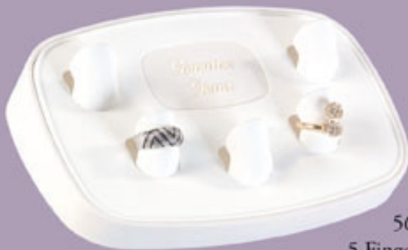
5605 5 Fingers, Logo