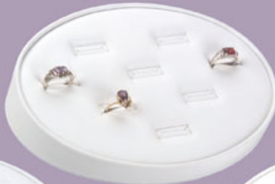
5632A 8 Slots