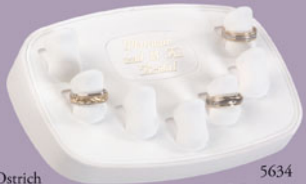
5634 7 Fingers, Logo