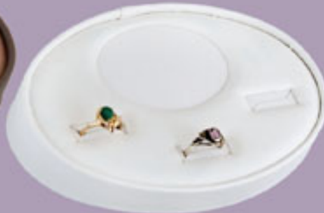
5687D 3 Slots, Logo