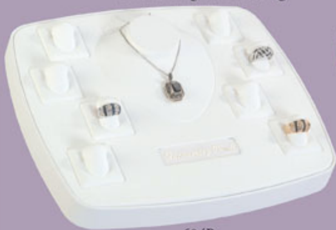
604P 8 Interchangeable Pads, 1 Necklace, Logo