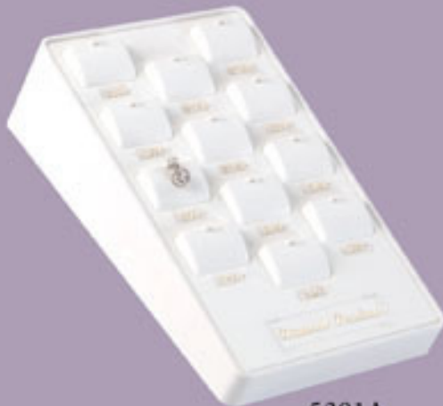
5381A 12 Interchangeable Pads, 12 Infoblocks, Logo