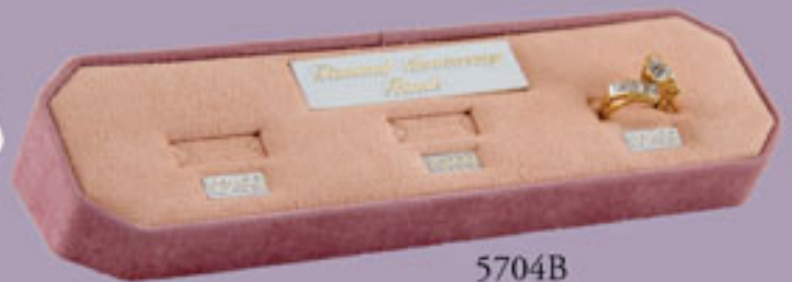
5704B 3 Slots, 3 Infoblocks, Logo Shown in Desert Rose Shadow frame and Peach Charisma top pad