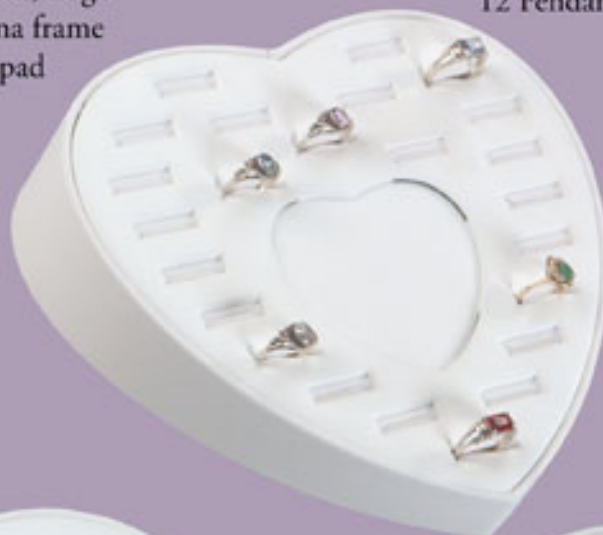
5809 24 Slots, Logo