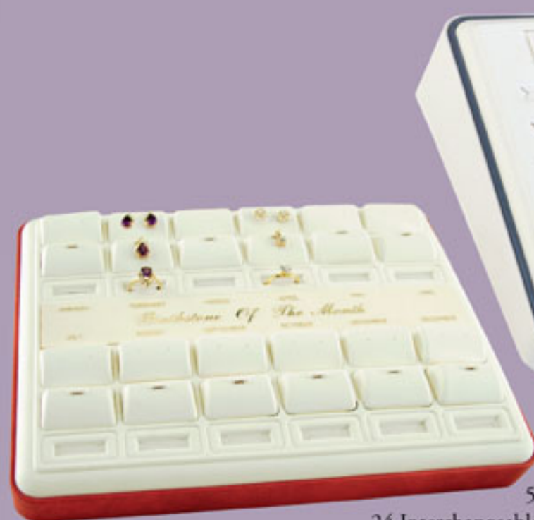
5553 24 Interchangeable Pads, 12 Slots, Logo Shown in Scarlet Elite frame and Off-White top pad