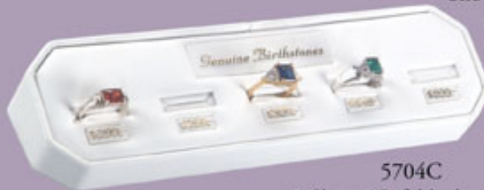
5704C 5 Slots, 5 Infoblocks, Logo