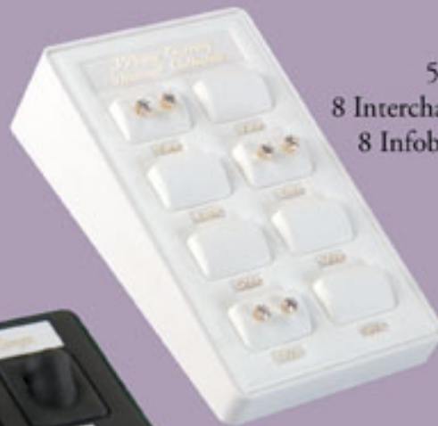
5378A 8 Interchangeable Pads, 8 Infoblocks, Logo