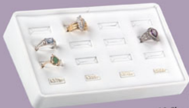
5323 12 Slots, 4 Infoblocks