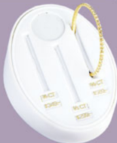
5624A 3 Bangles, 6 Infoblocks, Logo