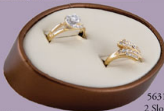
5631 2 Slots Shown in Copper Vienna frame and Peanut Vienna top pad