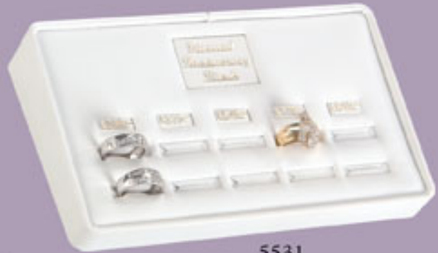
5531 10 Slots, 5 Infoblocks, Logo