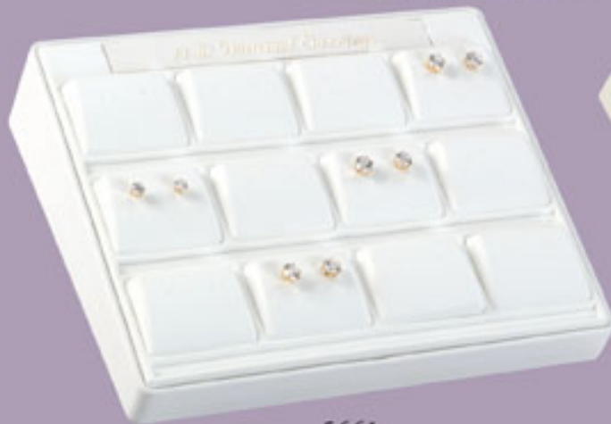
5661 12 Interchangeable Pads, 3 Infoblock Channels, Logo