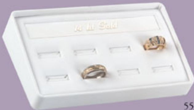
5532 8 Slots