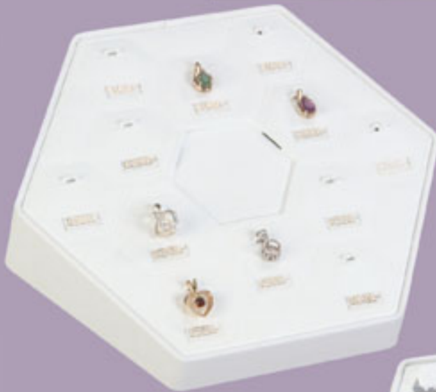
5817A 12 Pendants, 12 Infoblocks, Logo