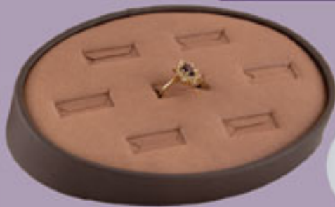
5630 7 Slots Shown in Chocolate Elite frame and Latte Elite top pad