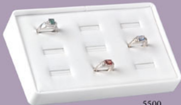
5500 9 Slots