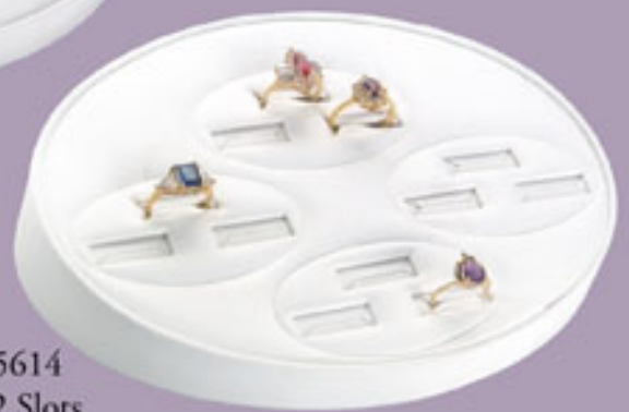
5614 12 Slots