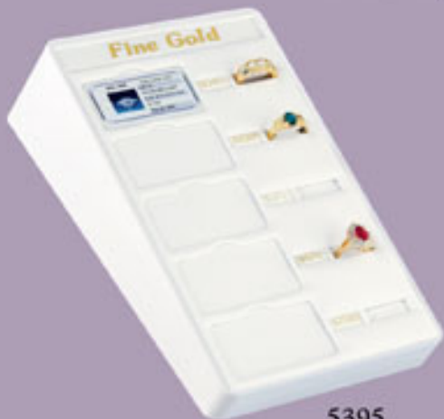
5395 5 Slots, 5 Certificates, 5 Infoblocks, Logo