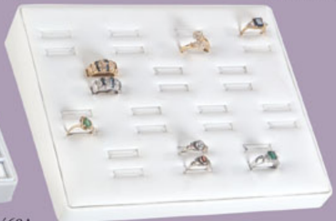
5475 14 Double Slots