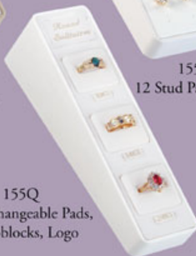
155Q 3 Interchangeable Pads, 3 Infoblocks, Logo