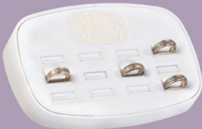
153G 12 Slots, Logo