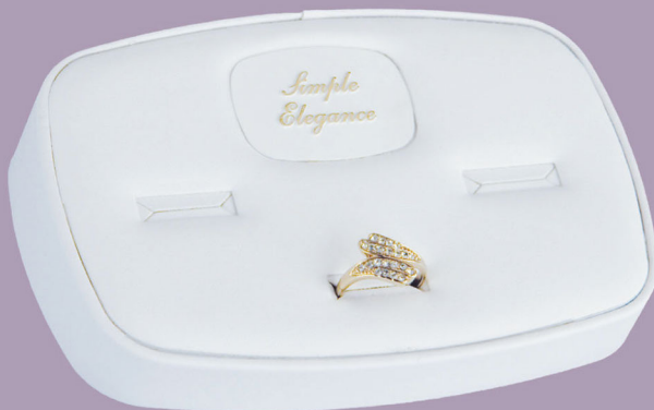
150S 3 Slots, Logo

Shown in Navy Vienna frame and Silver Vienna top pad