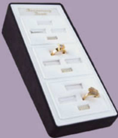
5165 9 Slots, 3 Infoblocks, Logo Shown in Black Shadow frame and White top pad