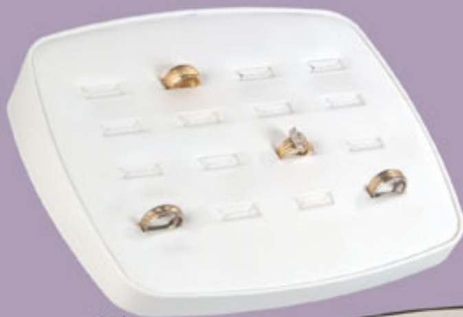
604 16 Slots, Silkscreen Logo