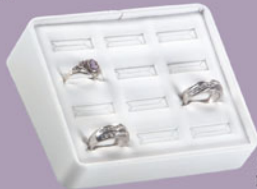
5103C 12 Slots