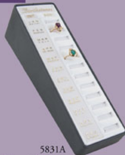
5831A 12 Rings, 2 Infoblocks, 2 Logos Shown in Graphite Elite frame and White top pad