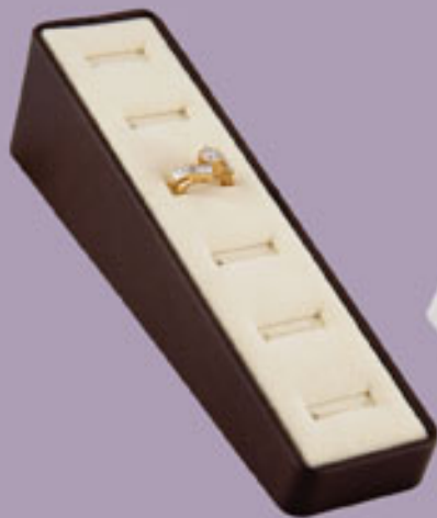
5717 6 Slots Shown in Chocolate Elite frame and Vanilla Charisma top pad