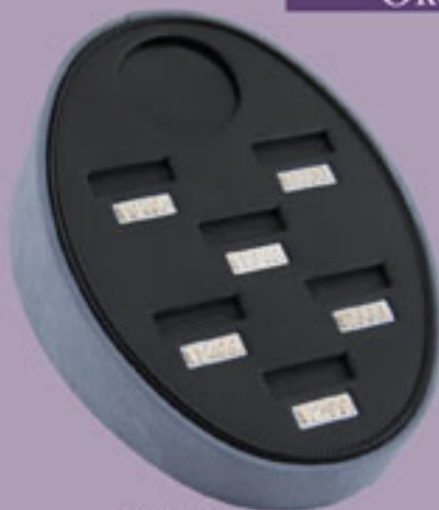
5623A 6 Slots, 6 Infoblocks, Logo Shown in Thunder Charisma frame and Black top pad