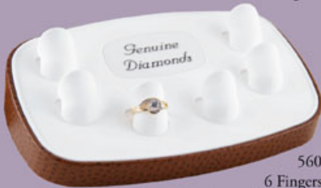
5606 6 Fingers, Logo Shown in Brown Vienna Ostrich frame and White top pad