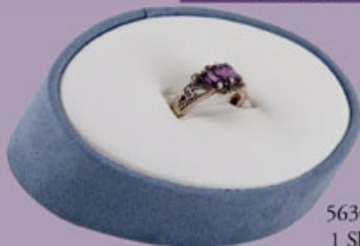
5630A 1 Slot Shown in Thunder Charisma frame and Almond Vienna top pad