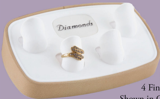
5651 4 Fingers, Logo Shown in Champagne Elite frame and White top pad