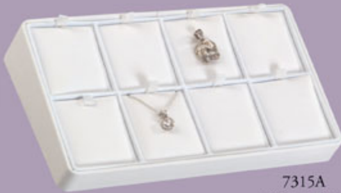
7315A 8 Plain Pads