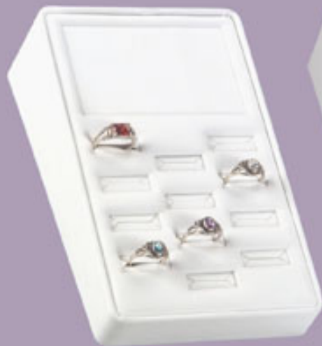
5517A 12 Slots, Logo