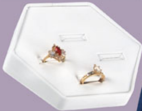
5812 4 Slots