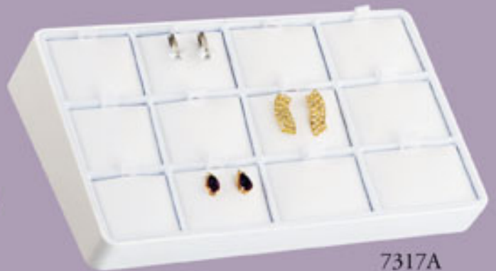
7317A 12 Plain Pads