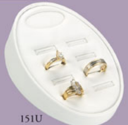
151U 8 Slots, Logo