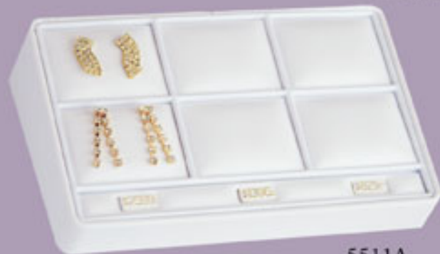
5511A 6 Pads, 3 Infoblocks

Standard slots sizes are 6mm and 8mm be sure to ask an Ovadia sales rep which you should use for your jewelry