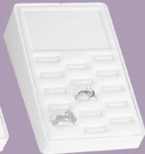
5519A 15 Slots, Logo