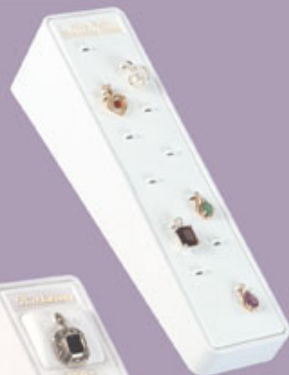
155B 12 Pendants, Logo