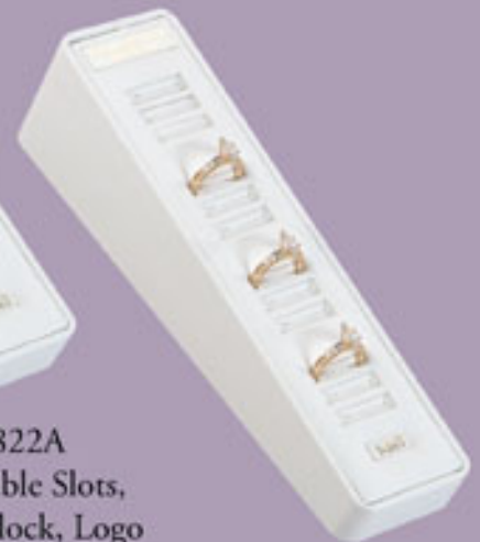
5823A 4 Triple Slots, 1 Infoblock, Logo