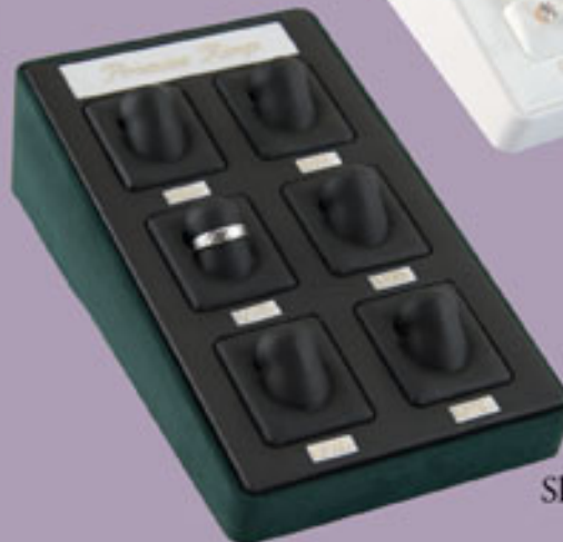
5390 6 Interchangeable Pads, 6 Infoblocks, Logo Shown in Jade Charisma frame and Black top pad