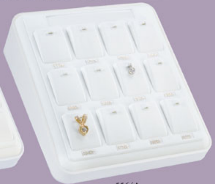
5564A 12 Interchangeable Pads, 12 Infoblocks, Logo