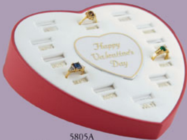
5805A 12 Slots, 12 Infoblocks, Logo Shown in Red Vienna frame and White top pad