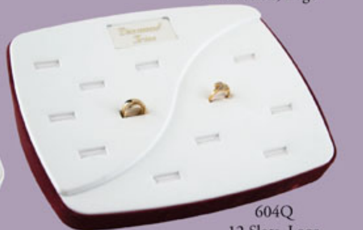
604Q 12 Slots, Logo Shown in Claret Shadow frame and White top pad