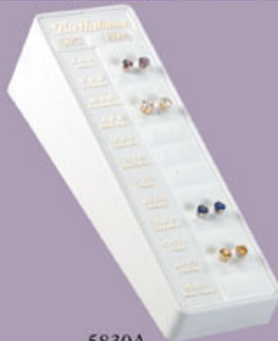
5830A 12 Stud Pairs, 2 Infoblocks, 2 Logos