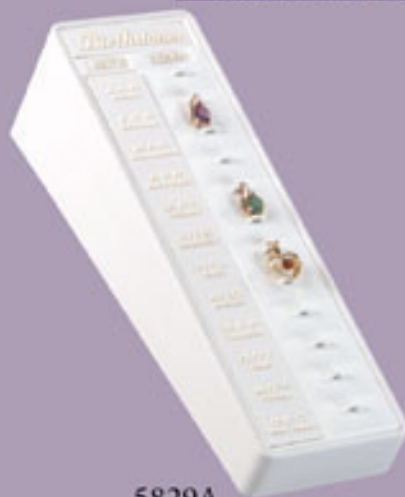
5829A 12 Pendants, 2 Infoblocks, 2 Logos