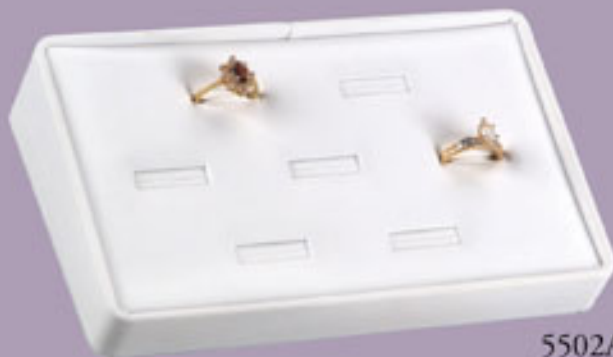
5502A 7 Slots