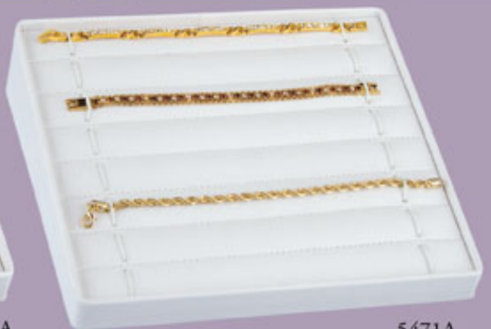
5471A 8 Bracelets