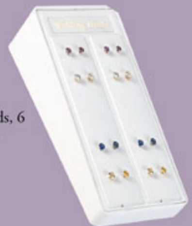
5208 20 Earrings, Logo