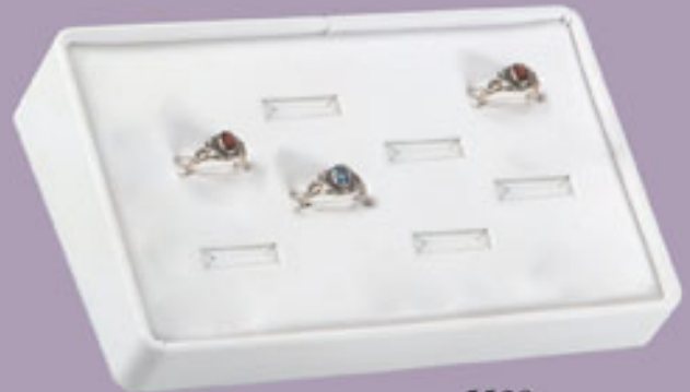
5539 8 Slots