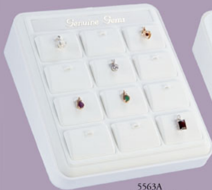
5563A 12 Interchangeable Pads, Logo