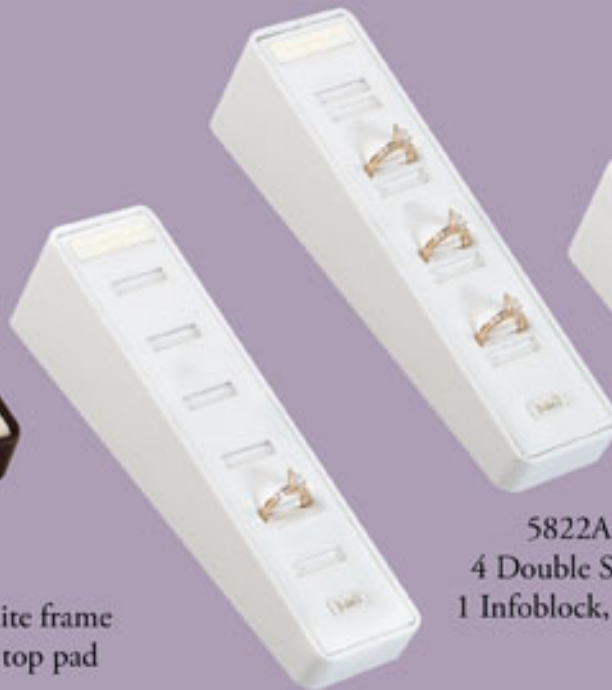
5822A 4 Double Slots, 1 Infoblock, Logo