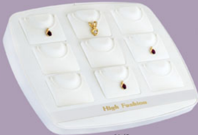
604I 9 Interchangeable Pads, Logo