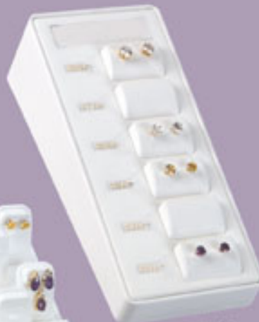
5168 6 Interchangeable Pads, 6 Infoblocks, Logo