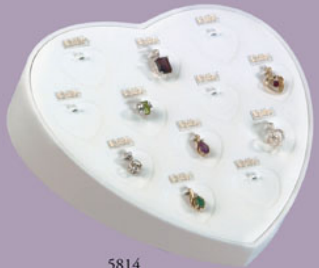
5814 12 Pendants, 12 Infoblocks