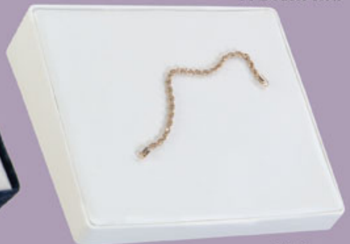
5477A Plain Pad