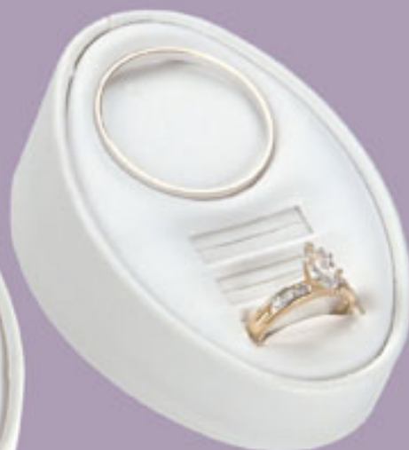
5604AL 3 Slots, Logo