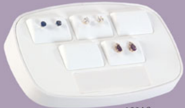
153AS 5 Interchangeable Pads, Logo