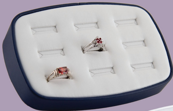
150X 9 Slots

Shown in Navy Vienna frame and Silver Vienna top pad