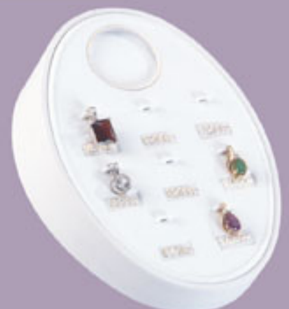
5622A 8 Z-Locks, 8 Infoblocks, Logo