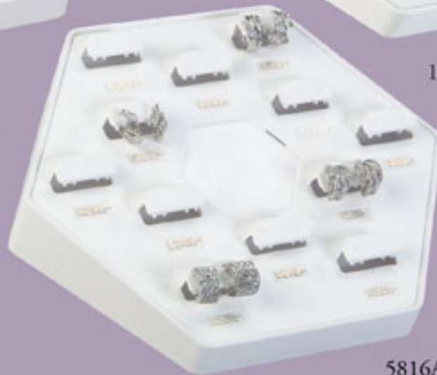
5816A 12 Earring Pairs, 12 Infoblocks, Logo