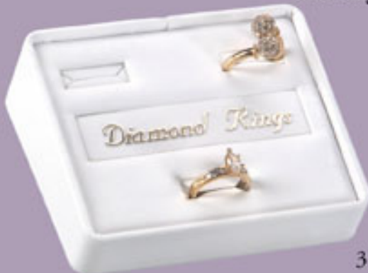
5101B 3 Slots, Logo