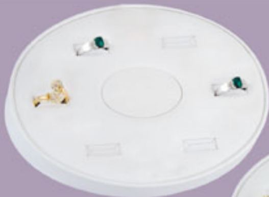
5632E 6 Slots, Logo