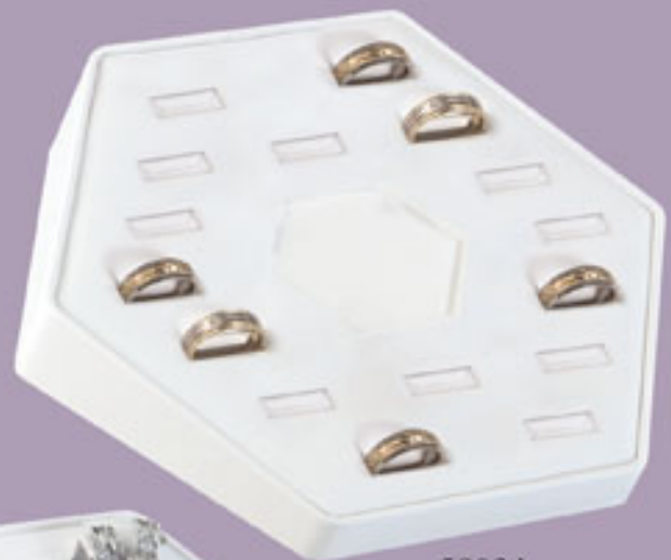
5802A 16 Slots, 1 Logo