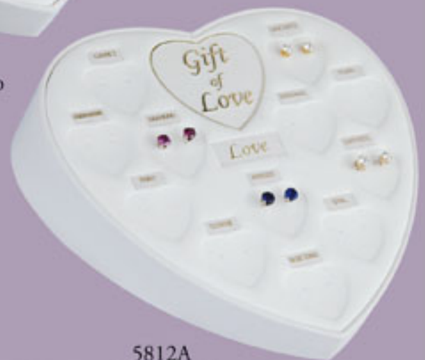
5812A 12 Earrings, 12 Infoblocks, 2 Logos