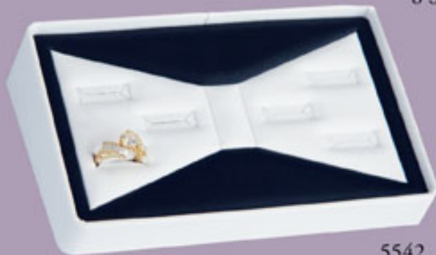
5542 6 Slots