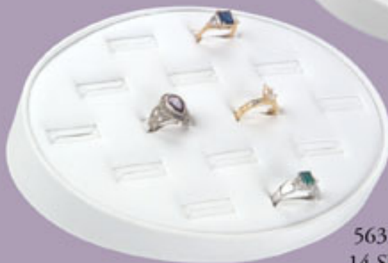
5632B 14 Slots