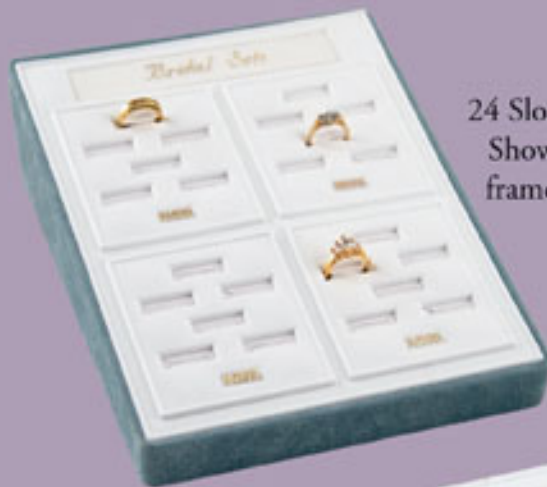
5460A 24 Slots, 4 Infoblocks, Logo Shown in Aspen Shadow frame and White top pad