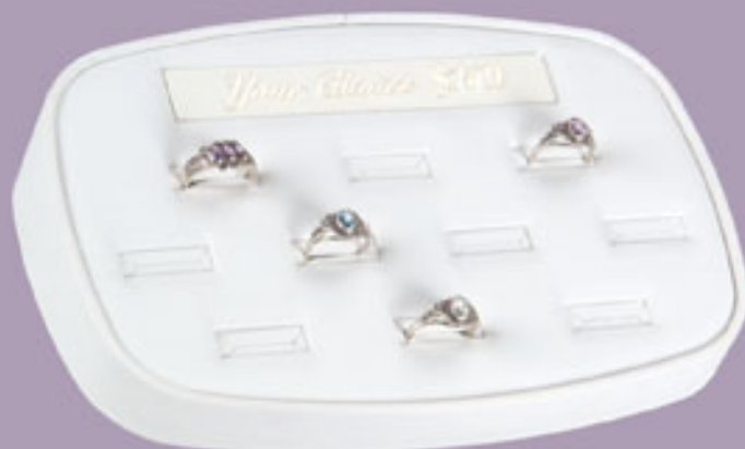
153A 10 Slots, Logo