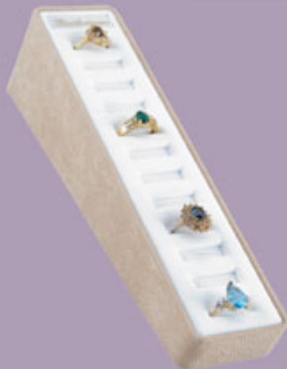
155A 12 Slots, Logo Shown in Sea Shell Shadow frame and White top pad