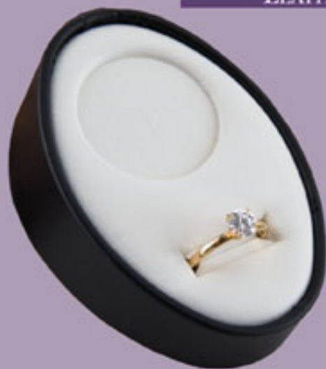
5656A 1 Slot, Logo Shown in Black Vienna frame and Pearle Vienna top pad