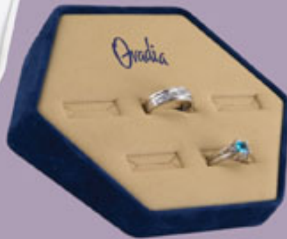
5803A 5 Slots, Logo Shown in Sapphire Shadow frame and Macadamia Elite top pad

All "leather" displays can have slots removed to create custom arrangements.