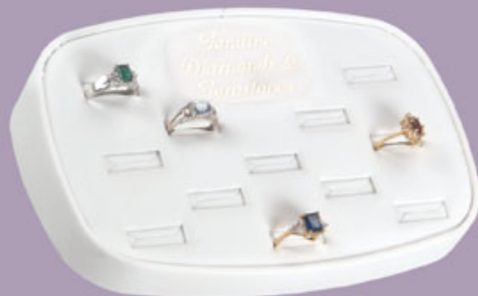
5641 12 Slots, Logo