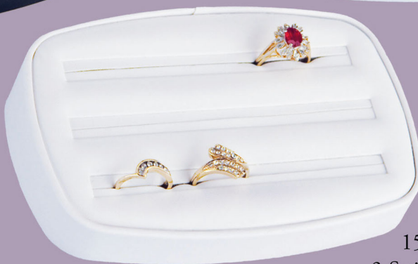
150E 3 Strip Slots