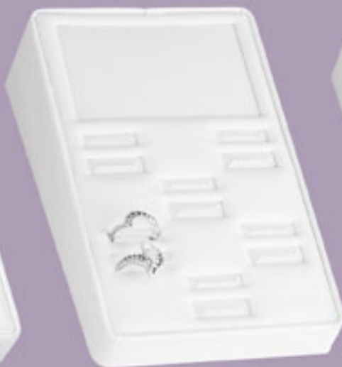
5518A 6 Double Slots, Logo