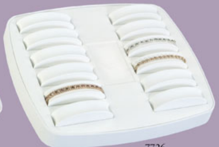
7726 12 Bracelets, Logo