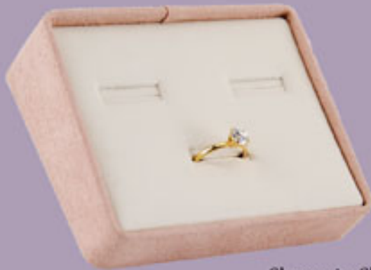
5101A 3 Slots Shown in Shrimp Charisma frame and Beige Vienna top pad