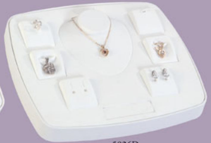
5826D 6 Interchangeable Pads, Necklace, Logo