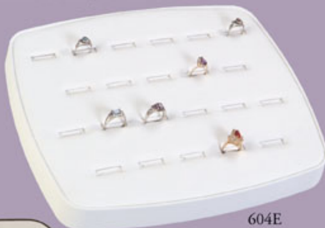
604E 22 Slots