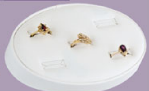
5687B 5 Slots