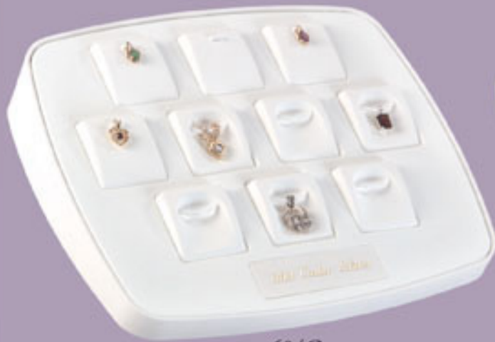
604G 10 Interchangeable Pads, Logo