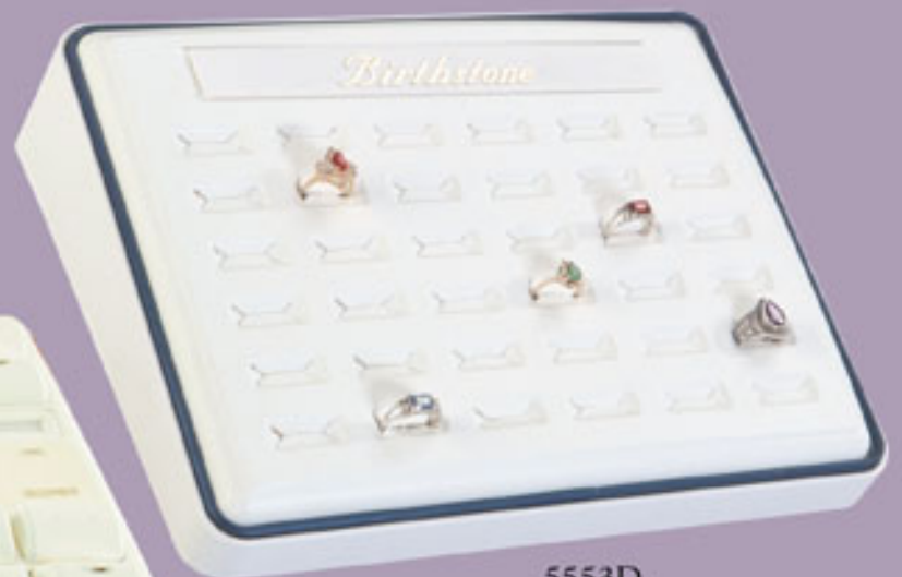
5553D 36 Slots, Logo