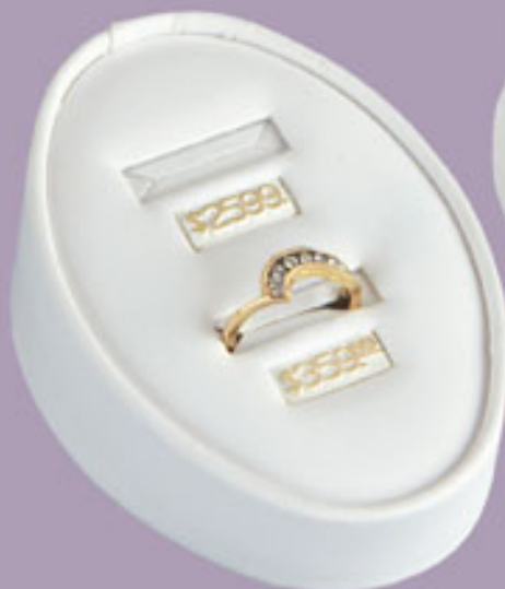
5657A 2 Slots, 2 Infoblocks