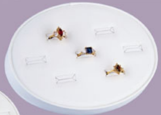
5632C 7 Slots