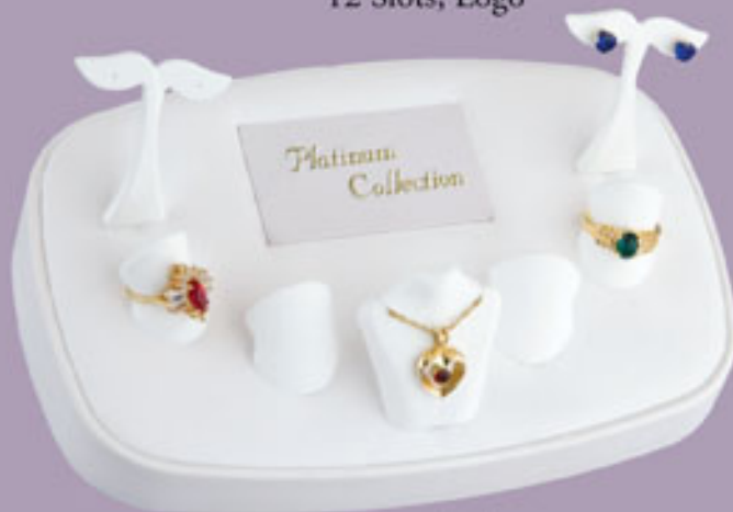
5654 7 Interchangeable Pads, Logo