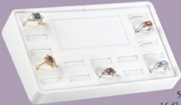
5526 16 Slots, Logo