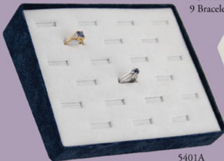
5401A 21 Slots Shown in Blueberry Shadow frame and Cloud Charisma top pad