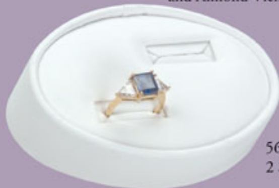
5631A 2 Slots