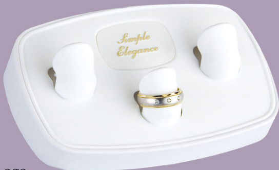
5650 3 Fingers, Logo