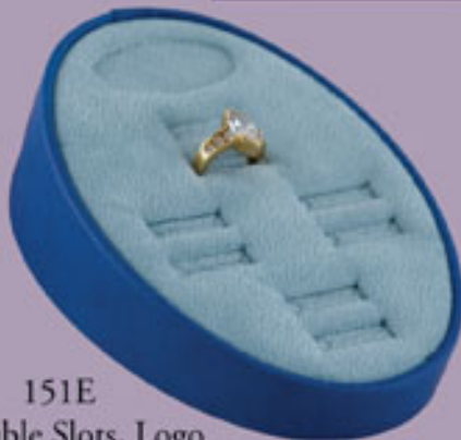
151E 4 Double Slots, Logo Shown in Royal Elite frame and Aspen Shadow top pad