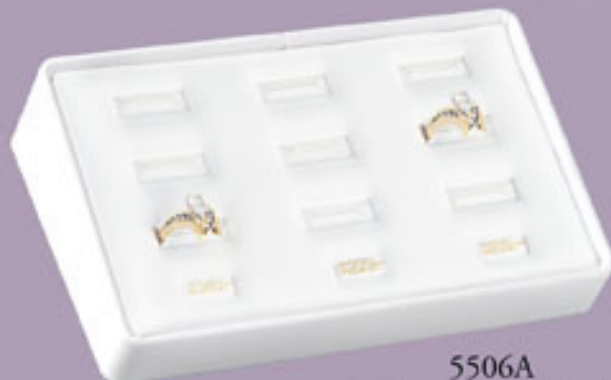
5506A 9 Slots, 3 Infoblocks