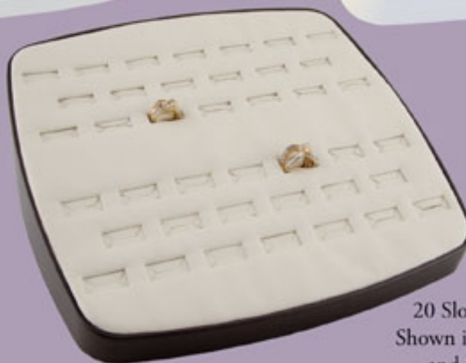
604B 20 Slots 8mm, 20 Slots 10mm Shown in Chocolate Vienna frame and Peanut Vienna top pad