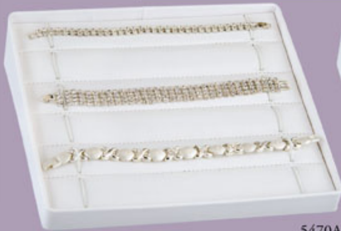
5470A 6 Bracelet