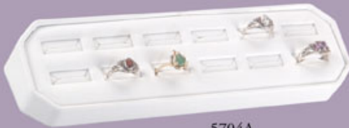
5704A 12 Slots