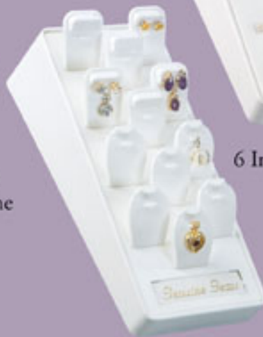
301 12 Standing Pads, Logo