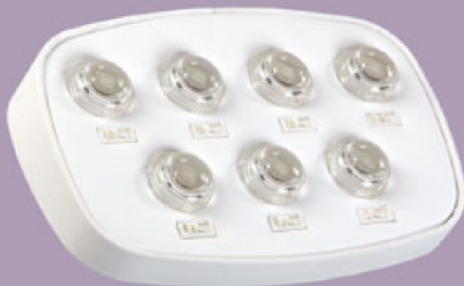
5686 7 Gem Cups, 7 Infoblocks