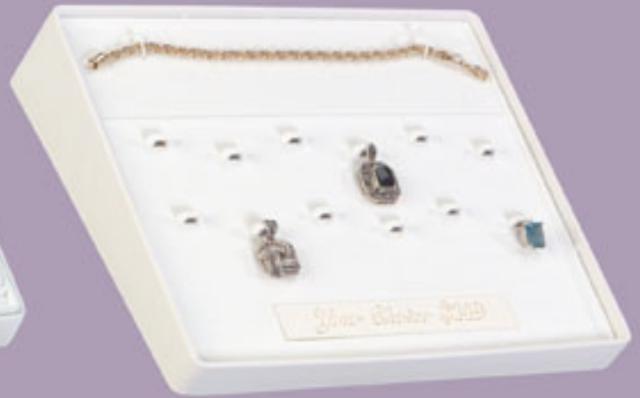
5675 12 Z-Locks, 1 Bracelet with Elastic, Logo