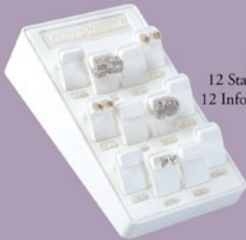
157A 12 Standing Pads, 12 Infoblocks, Logo