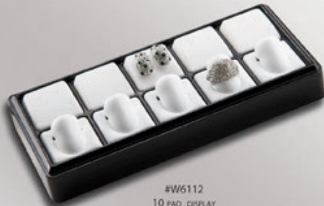
#W6112 10 PAD DISPLAY