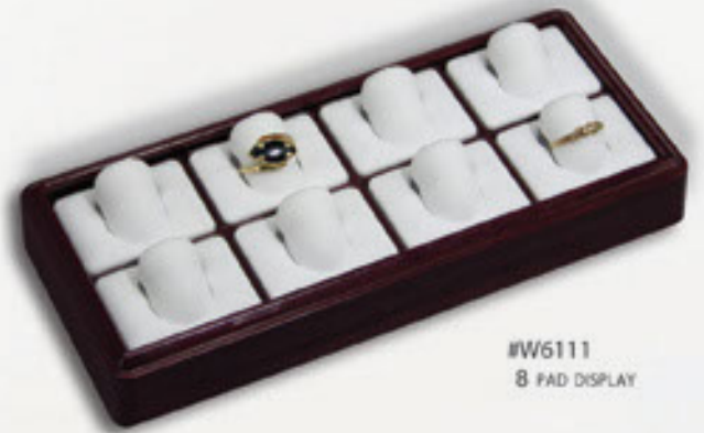
#W6111 8 PAD DISPLAY