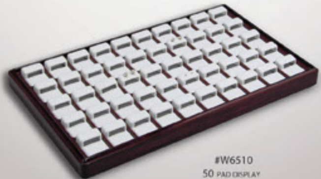
#W6510 50 PAD DISPLAY