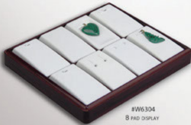
#W6304 8 PAD DISPLAY