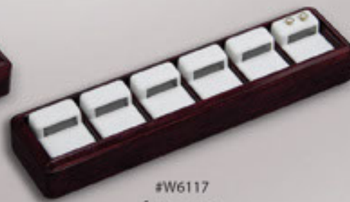
#W6117 6 PAD DISPLAY

ALL DISPLAYS AVAILABLE IN A VARIETY OF COLORS.