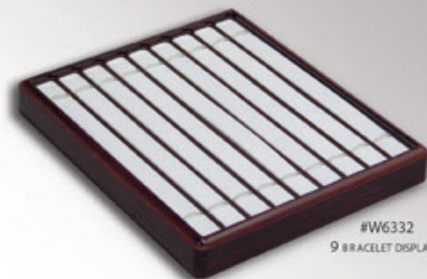
#W6332 9 BRACELET DISPLAY