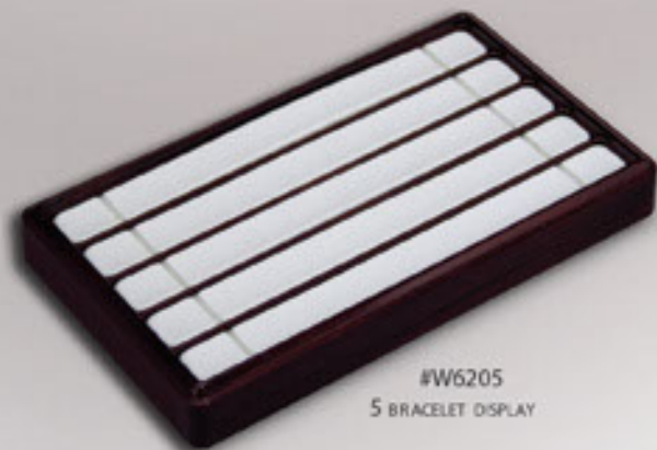
#W6205 5 BRACELET DISPLAY