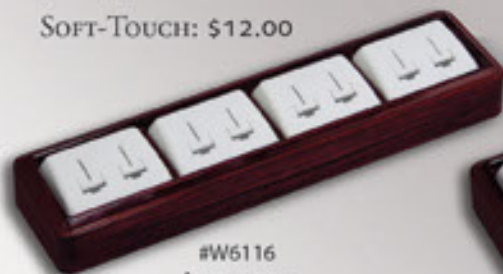
#W6116 4 PAD DISPLAY