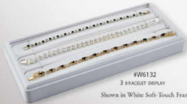
#W6132 3 BRACELET DISPLAY Shown in White Soft-Touch Frame