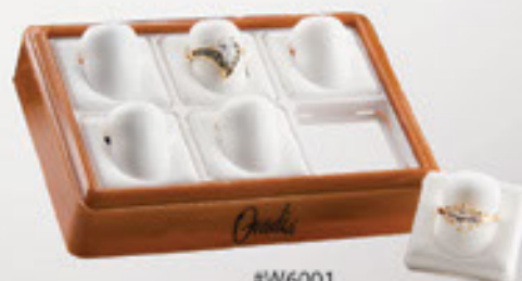
#W6001 6 PAD DISPLAY