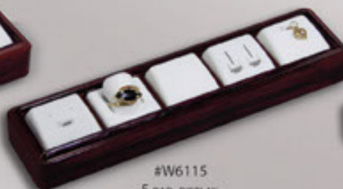
#W6115 5 PAD DISPLAY