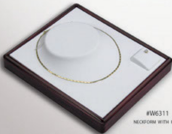
#W6311 NECKFORM WITH PAD