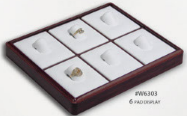
#W6303 6 PAD DISPLAY