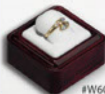
#W6002 1" HEIGHT 1 PAD DISPLAY