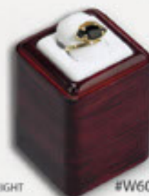
#W6004 3" HEIGHT 1 PAD DISPLAY