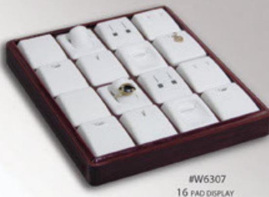
#W6307 16 PAD DISPLAY