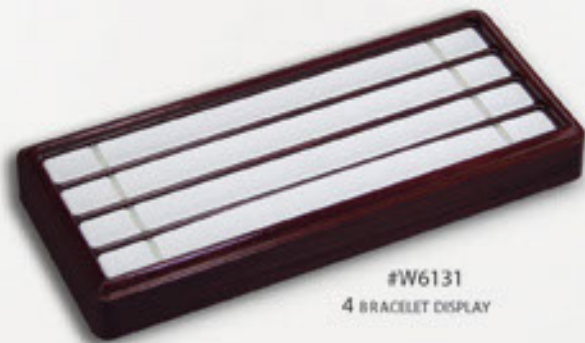
#W6131 4 BRACELET DISPLAY