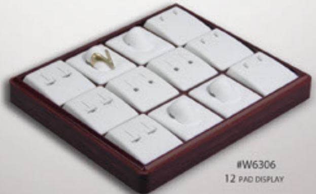
#W6306 12 PAD DISPLAY