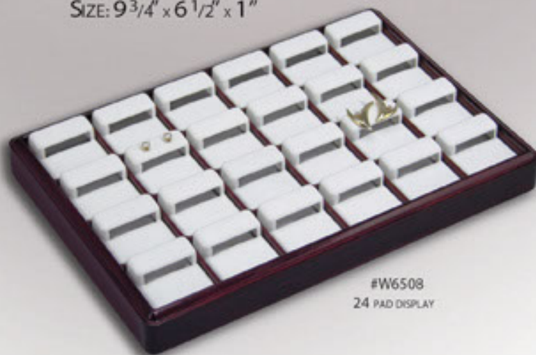
#W6508 24 PAD DISPLAY