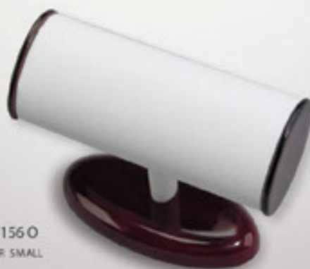
#W156O T-BAR SMALL