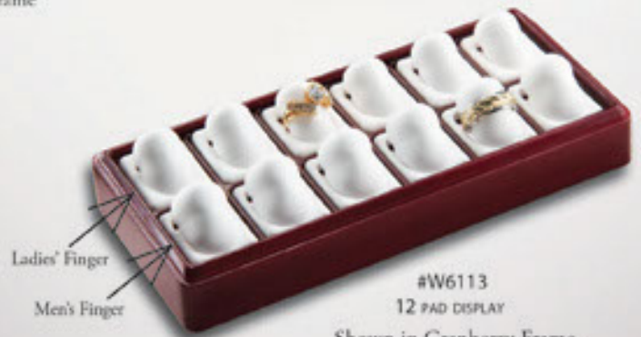
#W6113 12 PAD DISPLAY Shown in Cranberry Frame