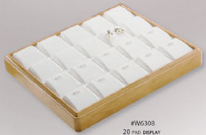
#W6308 20 PAD DISPLAY Shown in Natural Frame

Ask about our new body jewelry and cufflink Oro-Lite™ Pads!