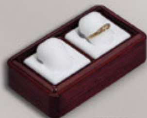
#W6120 2 PAD DISPLAY