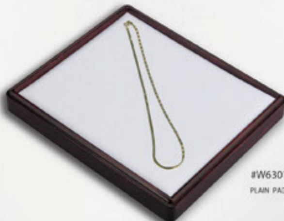
#W6301 PLAIN PAD