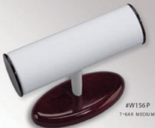
#W156P T-BAR MEDIUM