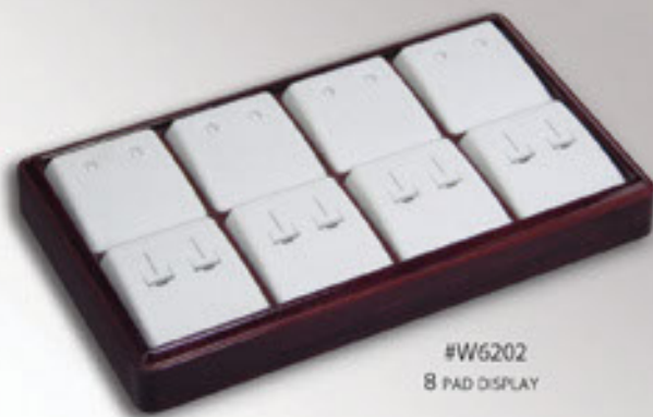
#W6202 8 PAD DISPLAY