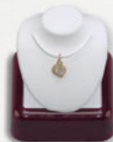
#W156V 3D NECKFORM W/SLIDE