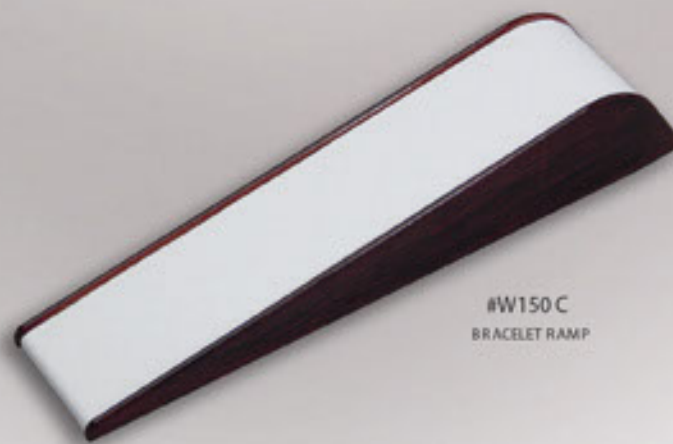
#W150C BRACELET RAMP

ADDITIONAL ACCESSORY STYLES AVAILABLE. PLEASE CALL FOR MORE INFO