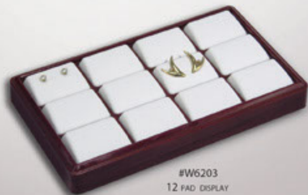
#W6203 12 PAD DISPLAY