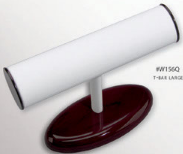
#W156Q T-BAR LARGE