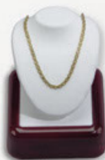
#W156E 3D NECKFORM