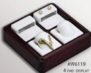
#W6119 4 PAD DISPLAY