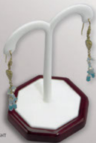
#W156BB 3" HEIGHT EARRING TREE