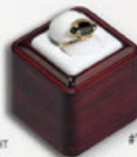
#W6003 2" HEIGHT 1 PAD DISPLAY