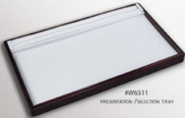
#W6511 PRESENTATION /SELECTION TRAY