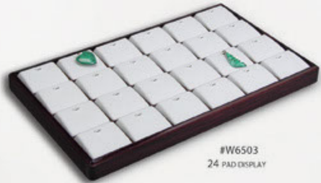
#W6503 24 PAD DISPLAY