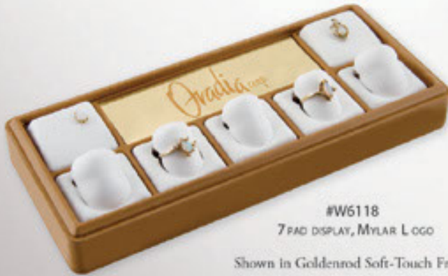
#W6118 7 PAD DISPLAY, MYLAR LOGO