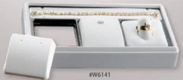
#W6141 3 PAD, 1 BRACELET DISPLAY