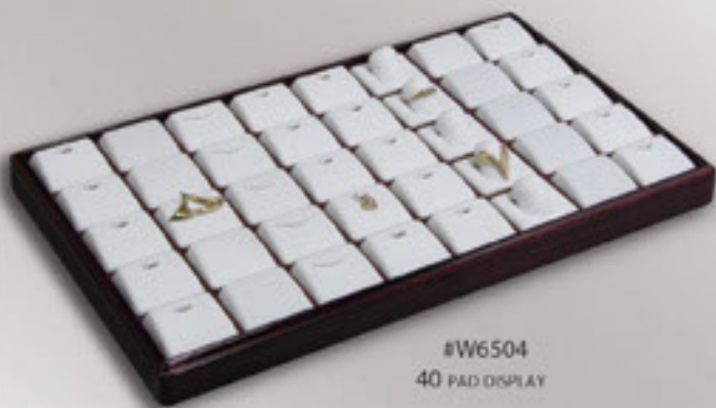
#W6504 40 PAD DISPLAY