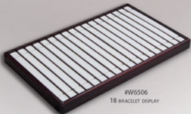
#W6506 18 BRACELET DISPLAY

U.S. Patents: #5,758,765; #5,913,417; #5,957,274