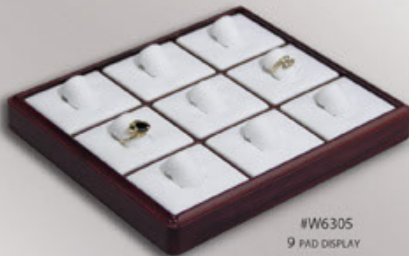
#W6305 9 PAD DISPLAY