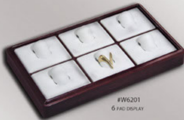
#W6201 6 PAD DISPLAY