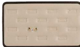
HCT14 14 RING SLOTS