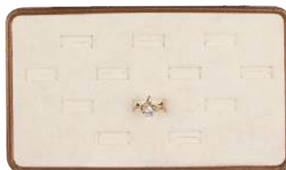
HCT12 12 RING SLOTS