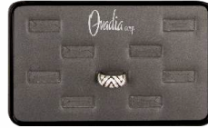
HCG9 9 RING SLOTS AND LOGO