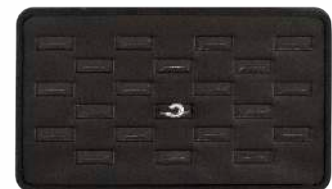
HCT21 21 RING SLOTS