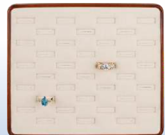
HCH35 35 RING SLOTS