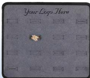
HCH16 16 RING SLOTS, AND LOGO