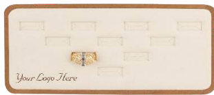
HCQ10 10 RING SLOTS AND LOGO