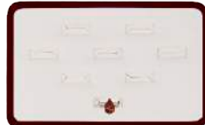
HCG8 8 RING SLOTS