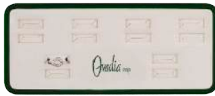
HCQ6D 6 DOUBLE SLOTS AND LOGO