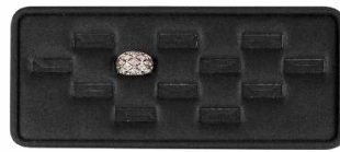
HCQ12 12 RING SLOTS