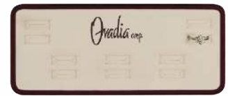
HCQ5D 5 DOUBLE SLOTS AND LOGO