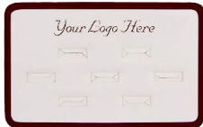
HCG7 7 RING SLOTS AND LOGO