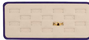
HCQ14 14 RING SLOTS