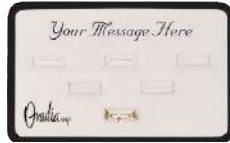
HCG6-1 6 RING SLOTS, LOGO AND MESSAGE AREA