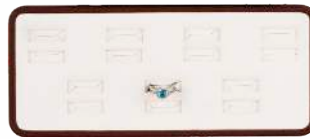
HCQ7D 7 DOUBLE SLOTS

Available in fabric wrapped, Reel Wood and soft touch finishes