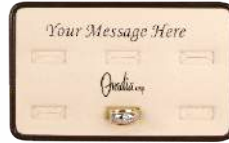
HCG6-2 6 RING SLOTS, LOGO AND MESSAGE AREA