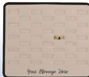
HCH32 32 RING SLOTS AND LOGO